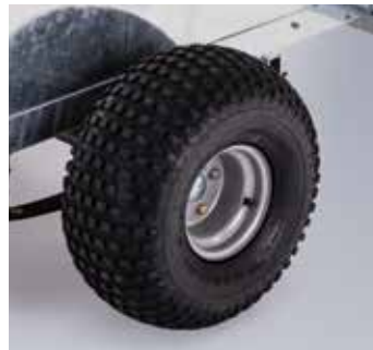
Q5e off-road knobby tyres (22 x 11-8)