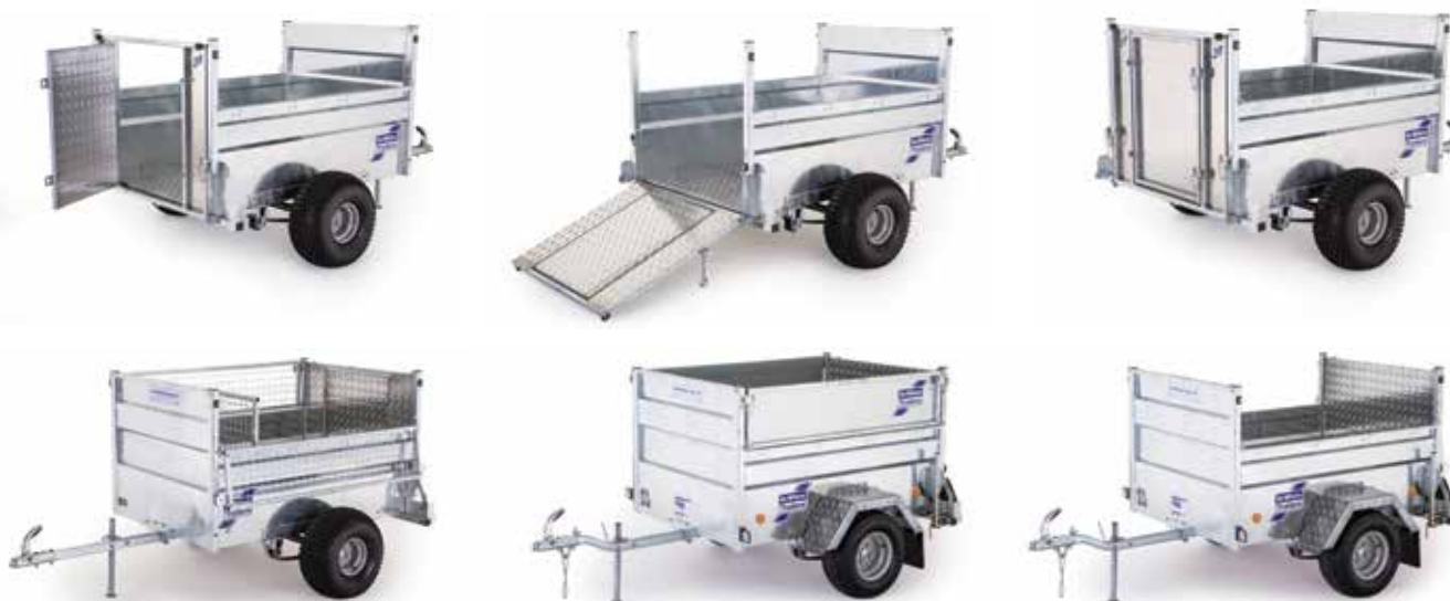
Q5 Q5e off-road and road versions showing different ramp, hinged sides and internal partition options