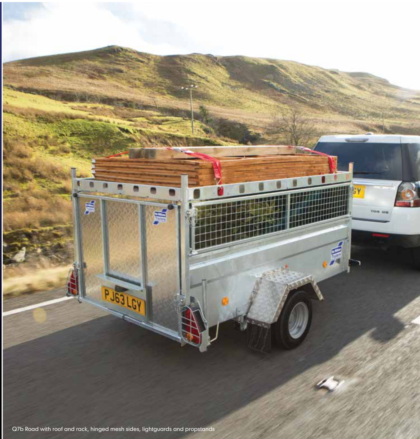
Q7b Road with roof and rack, hinged mesh sides, lightguards and propstands

We are an independent company with one focus: to build the best products on the market. More than 30,000 people choose our trailers each year – but we are not standing still. Our dedicated investment in new technologies and materials ensures that our products continue to exceed the expectations of our customers. We know that quality, strength, value and ease of maintenance are of vital importance to you. That is why we have made them the driving force behind everything we do.