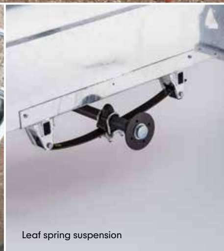
Leaf spring suspension