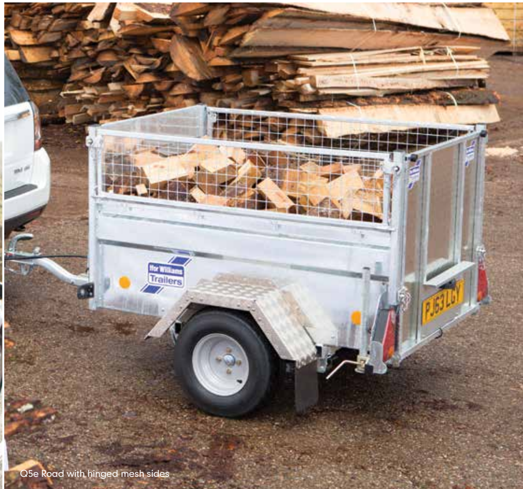
Q5e Road with hinged mesh sides

*Please check towing vehicle manufacturer's handbook for maximum unbraked towing limit.