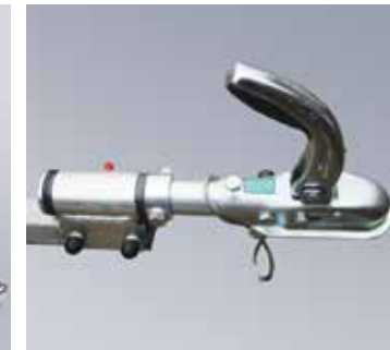
Swivel Hitch option available for off road use only (Not type approved for road use*)