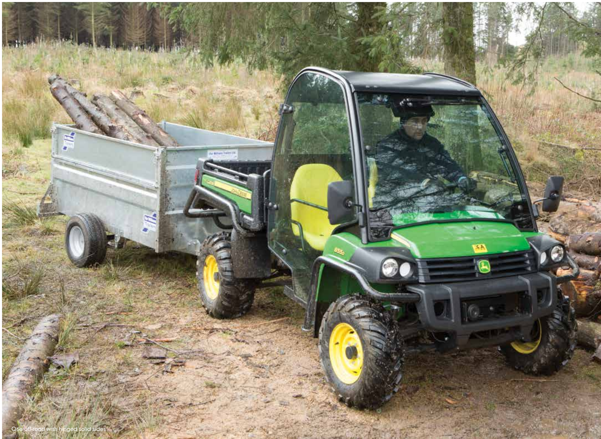
Q6e off-road with hinged solid sides