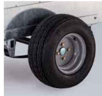
Q5/6/7e off-road flotation tyres (20.5 x 8-10)