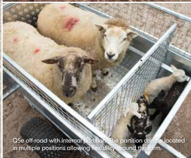
Q5e off-road with internal partition. The partition can be located in multiple positions allowing flexibility around the farm.