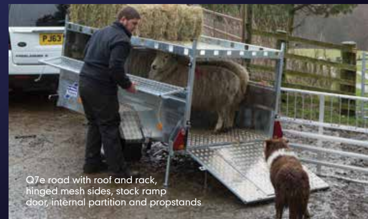
Q7e road with roof and rack, hinged mesh sides, stock ramp door, internal partition and propstands

* The roof and rack has a maximum recommended weight of 50kg and uses two fasteners which are easily removed.