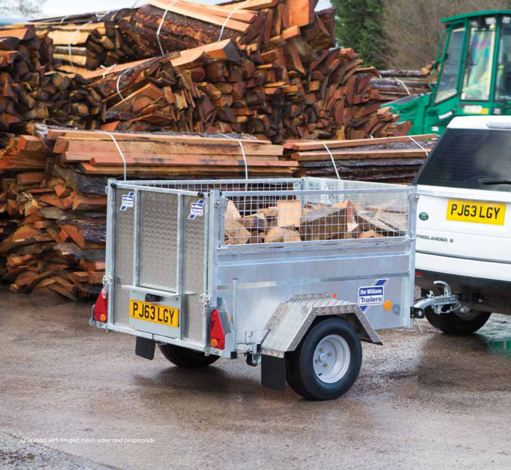
Q5e road with hinged mesh sides and propstands