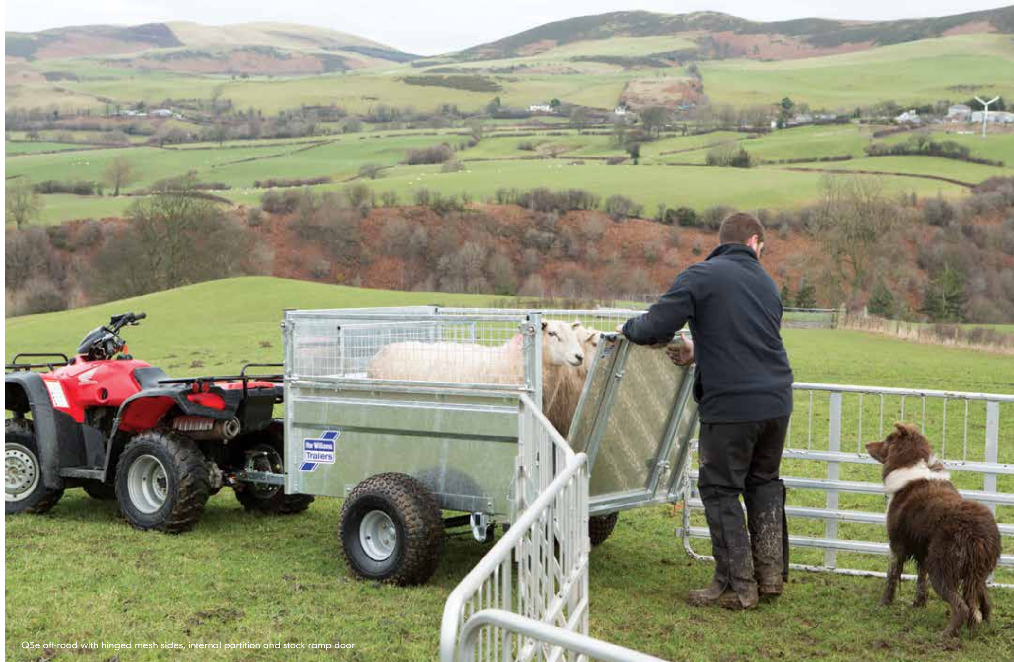
Q5e off-road with hinged mesh sides, internal partition and stock ramp door