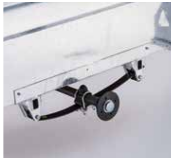
Leaf spring suspension is standard