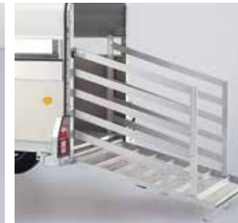
Optional ramp gates available on Q6, 7 and 8