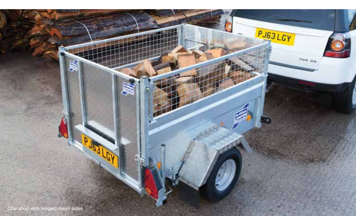
Q5e road with hinged mesh sides